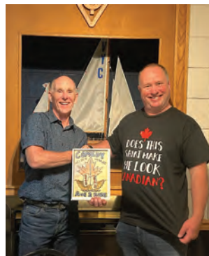
Comedian Big Red Entertained the Crowd During A Band Break