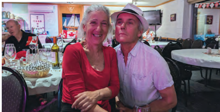
All The Best Dancers Were Out For Canada