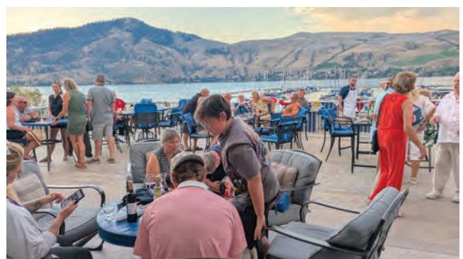
A Perfect Okanagan Afternoon for BBQing Ribs