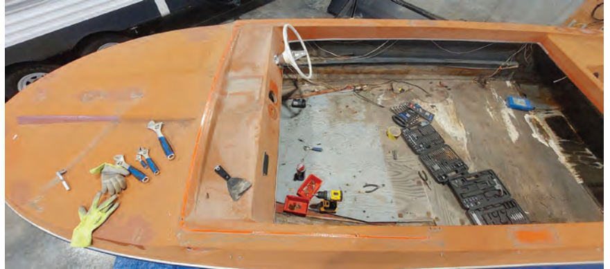
The Orange Boat Salvaged From Apex Lake

In the pinnacle of the show the crazy trio drifted and raced with SUVs and pickup trucks while towing boats. The goal of the show was to capture the flag from the opposite side of Apex Lake . Well, two out of three boats did not even make to the water’s edge. One got stuck and another got completely destroyed by Jeremy Clarkson.