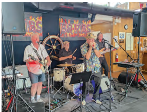
The BluesHounds Bring The Tunes