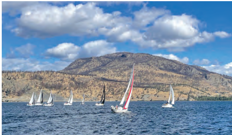
Perfect Conditions for Young Racers During the U35 Regatta

By all accounts the NOSA youth had a great time, and this regatta was considered a huge success. The young sailors had the opportunity to meet and network with each other and share a common interest in the sport of sailing. Regattas such as these are essential to develop an interest in sailing by young adults and based on the interest in this year's U35, I expect we'll see more in the future.