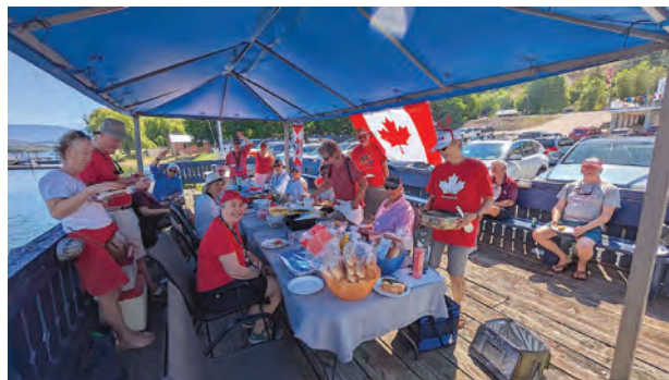
The Crowd Gathers for the Feast and Race Meeting

As the hours crept by, boats slowly dropped from the race, leaving a stubborn duel between Dragonfly and