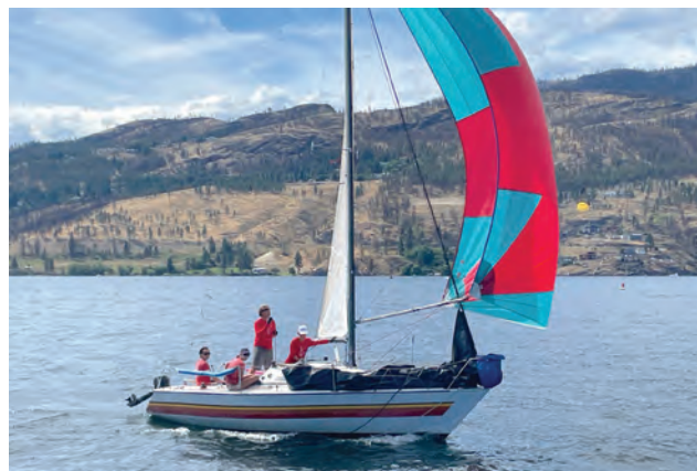
NOSA Crew of RI Competing in the U35 Regatta