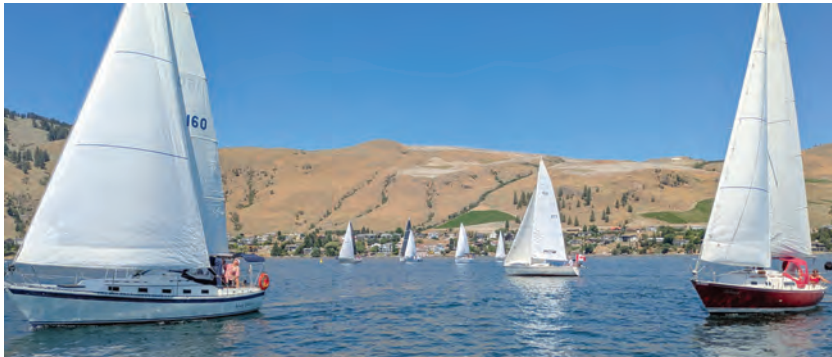
Canada Day Race Start