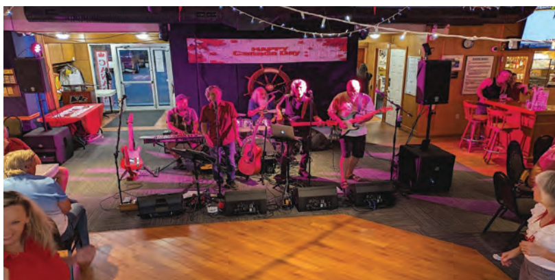
Feet First for Canada First!

A special birthday party was held at VYC on Saturday July 5th. The Knot 51 Canada Birthday Bash was a gentle nautical jab at our giant to the south (not the 51st). It was another full house and made special with Feet First being there to play Oh Canada for us along with all their great dance tunes. And it was special because the band was courtesy of Okanagan Restoration Services Ltd. The beef dip and the appie menu were a big hit before the band hit the stage and the people hit the dance floor!