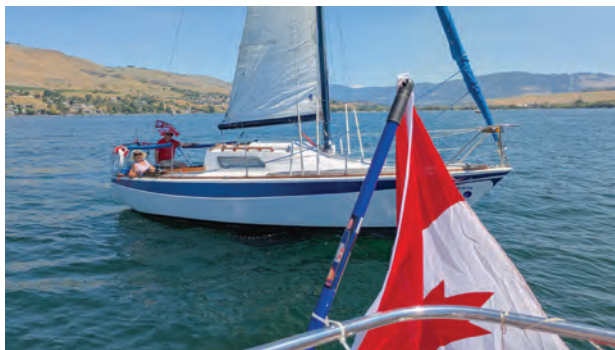
Skippers with Crew Endured The Heat And Light Winds On Canada Day Including Dave and Linda H on Eagle Moon