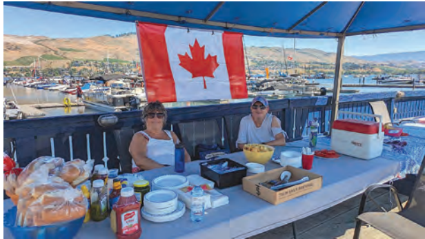
Holding Down The Fort For Canada Day Pot Luck

Canada Day dawned hot and windless, the kind of day when the lake looks more like glass than water. Still, fifteen boats and thirty-five hopeful skippers and crew gathered at VYC for a day of food, fun, and a little friendly competition. The festivities began ashore with a smokie and potluck BBQ, followed by boat decorating that turned the docks into a floating sea of red and white.