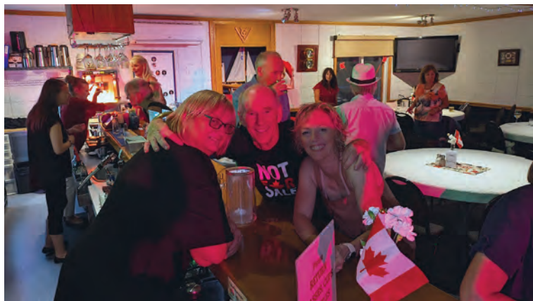
These Three Say "Canada is Not For Sale"

Everyone looked terrific in their favourite maple leaf attire. Our decorating team did a fine job setting the mood. It was a VYC birthday bash to remember!