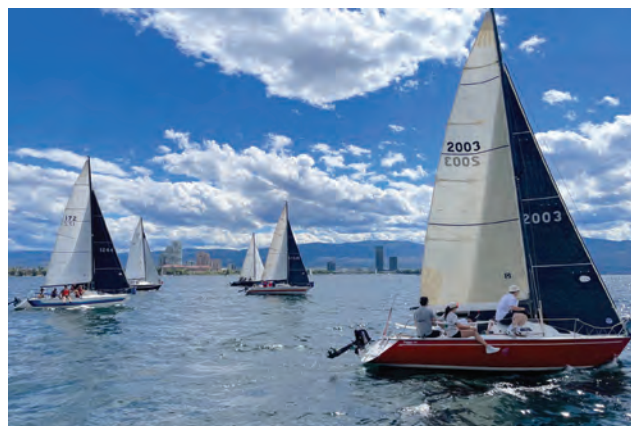
U35 Fleet Commodores Cup Regatta