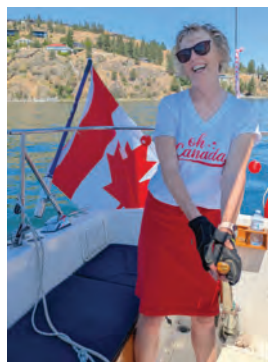
Canada Girl At The Helm

Thanks go to all participants—and to Twin Sails Brewing of Port Moody, whose prizes of Low Life lager made the winners smile just a little brighter.