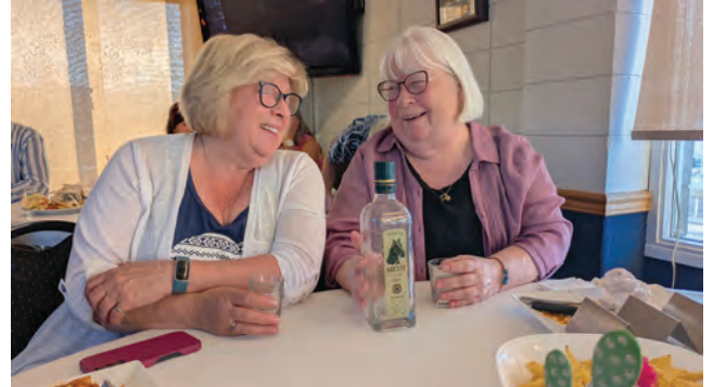
Seeing Double - Sisters Enjoy the Tequila Tasting