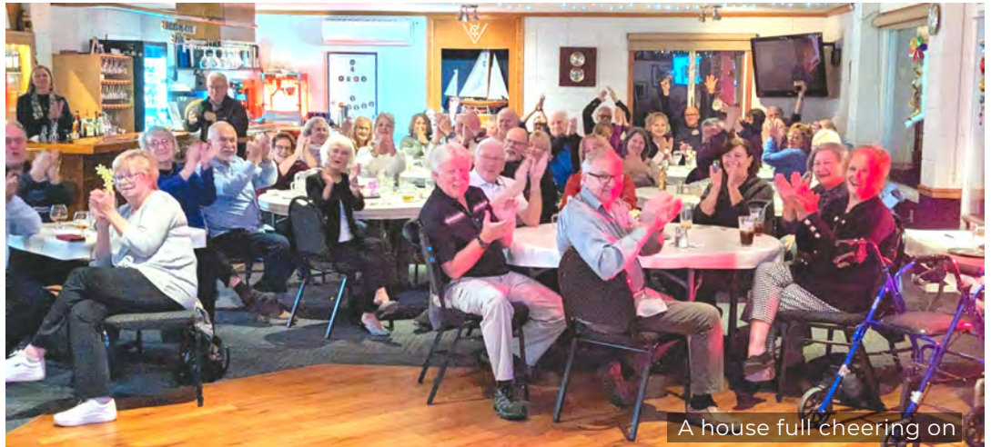
A house full cheering on