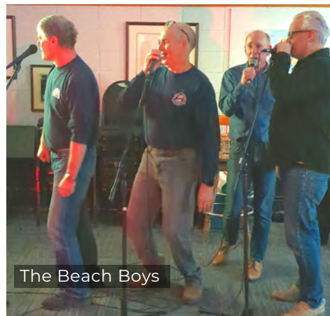
The Beach Boys