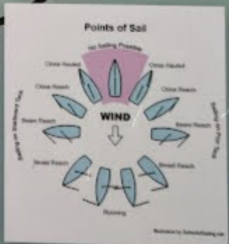
Illustrated by Lyle Doucette