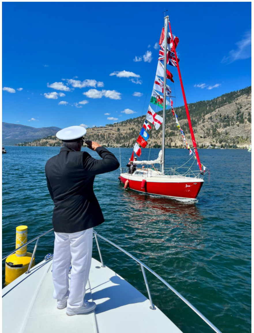
Our Commodore at Sail Past on July 16