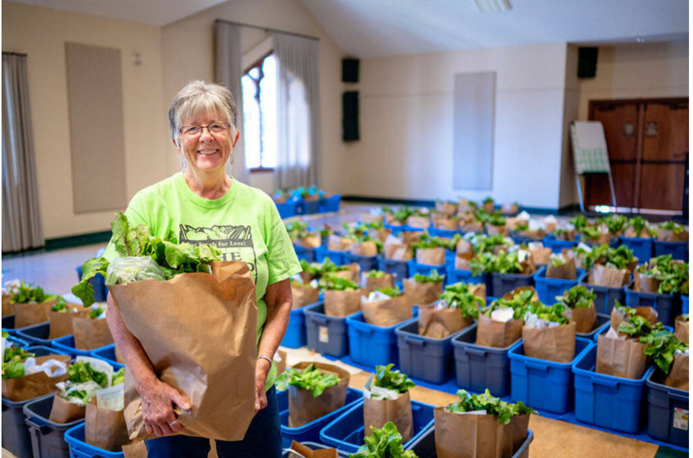
Photo - One of the many beneficiaries of both United Way BC and Community Foundation North Okanagan - The Good Food Box Society – serving fresh fruits and vegetables to our communities.