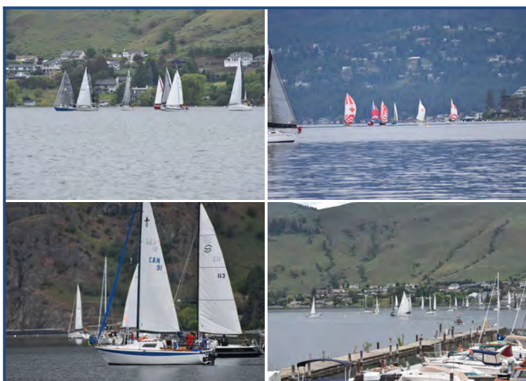
Images from the 2022 Vernon Yacht Club Regatta