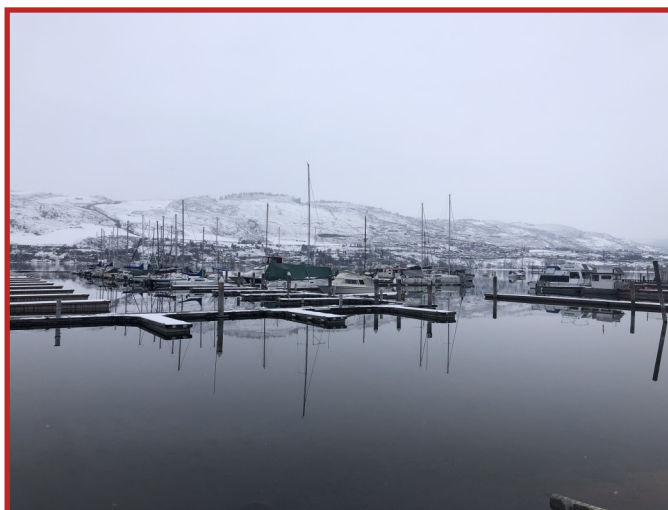
A calm winter's day