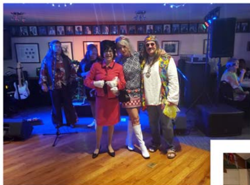
Winners of the Costume Contest (above)