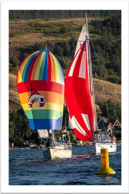
B Fleet boats at a downwind turn