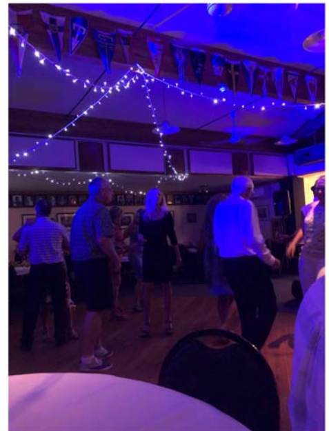
Another great Pig Roast! Entertainment provided by Feet First