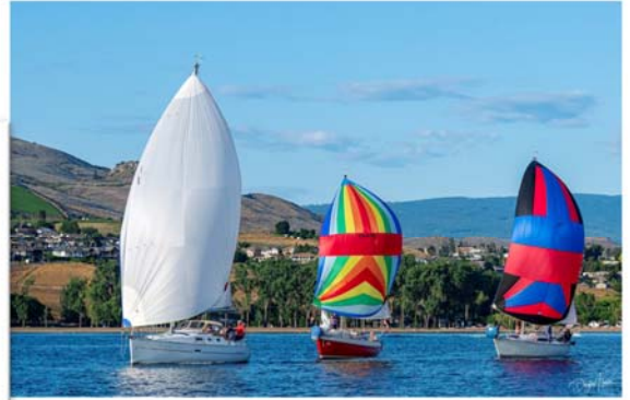
Top: B Fleet 'chutes Bottom: Ayesha and Mystique at close quarters