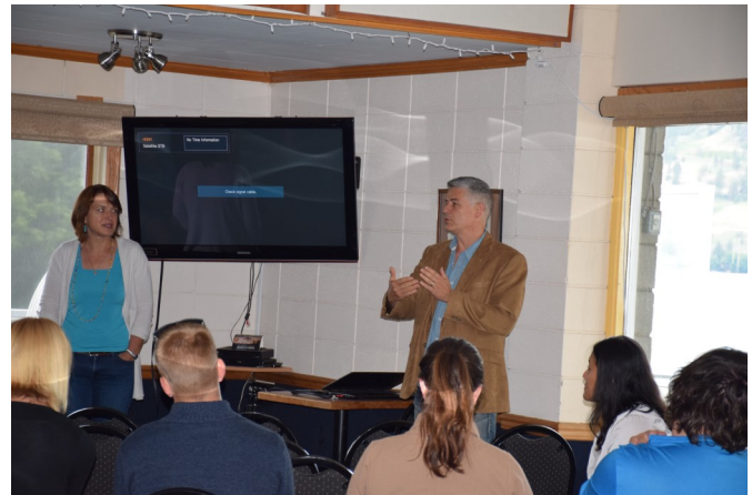
Photo Gallery of the 2018 Commodore's Ball & Sail Past June, 23 & 24!