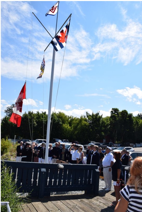
Flag raising ceremony before the June 24th Sail Past.