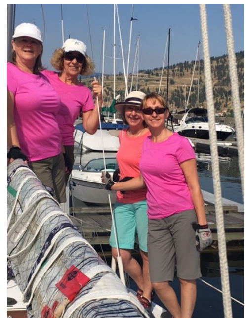
Crew of Ayesha