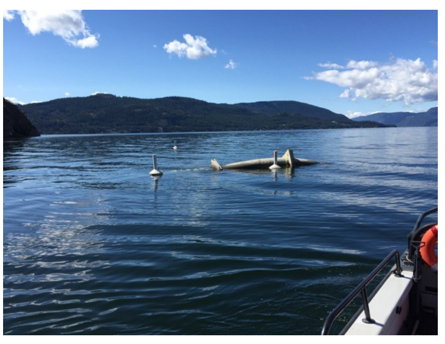
Even the City of Vernon needed Station 101's help when an outflow pipe surfaced.