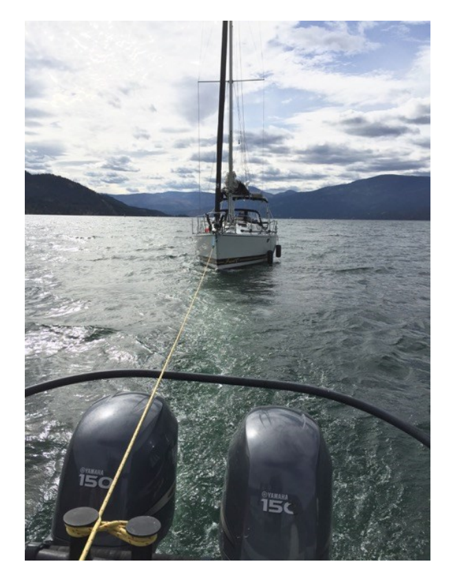
Sailboat in tow.