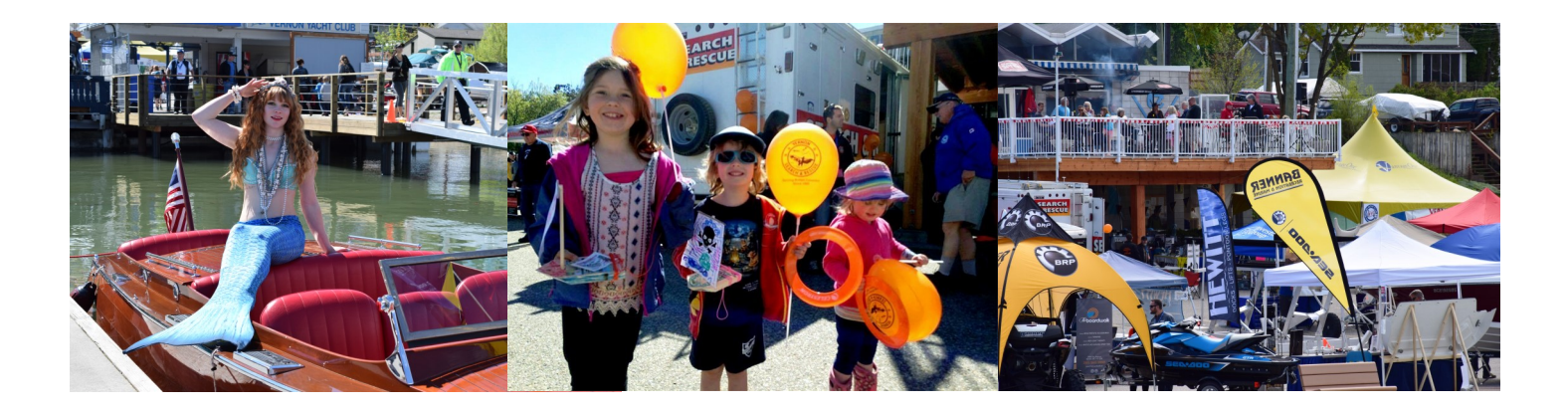
For 2018 Boat & Watersports Show information go to vernonyachtclub.com/boating/vernon-yacht-club-boat-show/