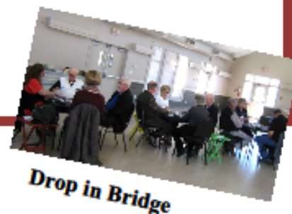
Drop in Bridge

Become a member now and make your voice heard in the community.