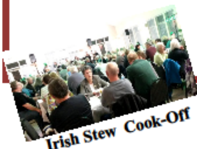
Irish Stew Cook-Off